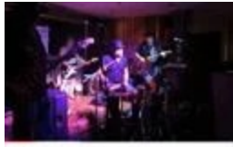
DK's Wolf Knockin On Heavens Door #Abby's

A beautiful song. DK's wolf band forever in our hearts.